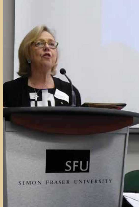
Green Party leader, Elizabeth May spoke at the Vancouver branch AGM on Feb. 11, 2016