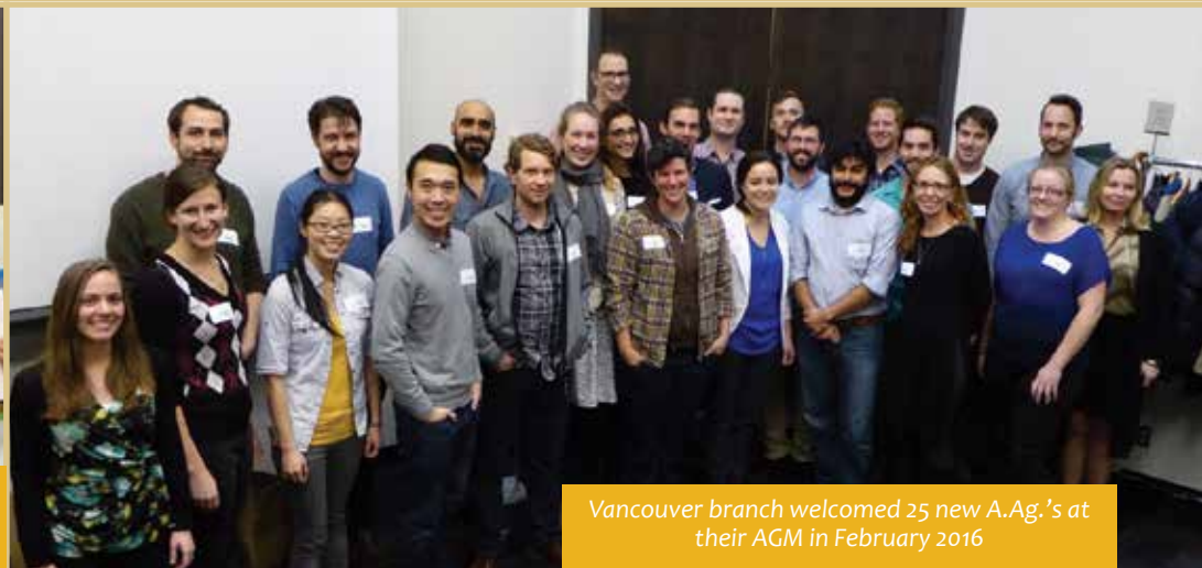
Vancouver branch welcomed 25 new A.Ag.'s at their AGM in February 2016